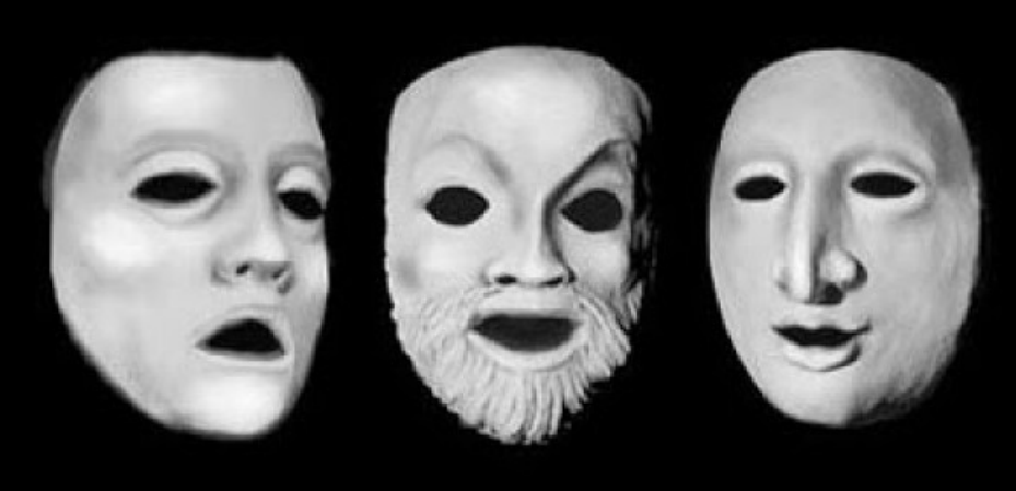
השטן השופט הסוהר the bailiff the pontiff the sheriff